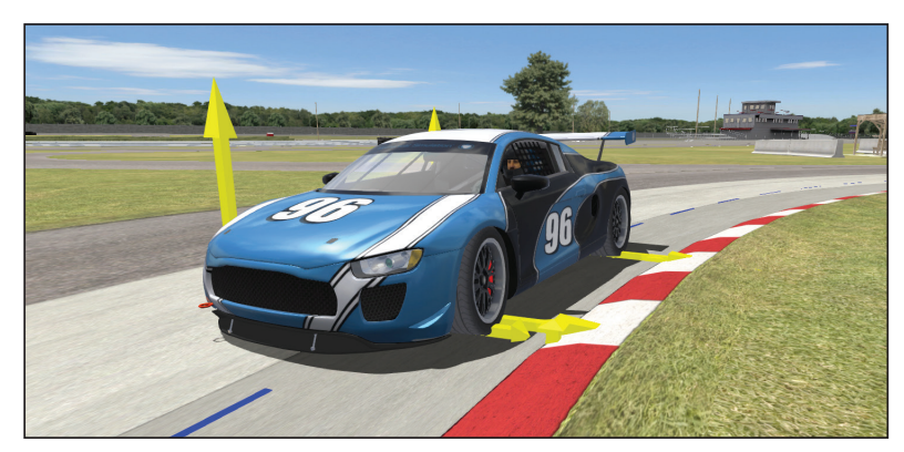
Closed-loop driver model and detailed road profile